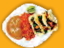
Poblano Shrimp Tacos