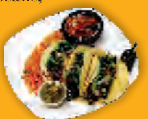
Tacos al Carbon

Three (3) fried corn tortillas topped with refried beans, seasoned chicken or ground beef, lettuce, tomato, crema mexicana, fresh cheese and hot sauce ... $8.99