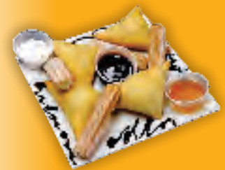
Sopapillas & Churros

Flan ..... $3.99 Tres Leches ..... $3.99 Sopapillas Six (6) Count ..... $6.99 Sopapillas & Churros ..... $7.99